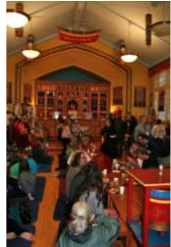
Youth at Tibetan Buddhist Temple for Lotus Fest (10/5)