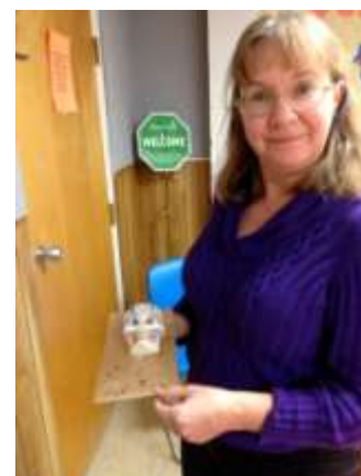
Monday Menus - Making Sugar Skulls (10/14)