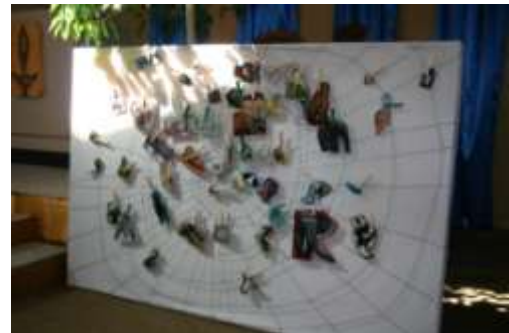
Interconnected Web with Animals (10/6)