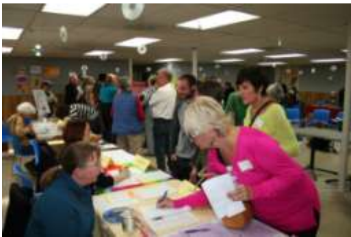
South Valley Programs Fair (10/6)