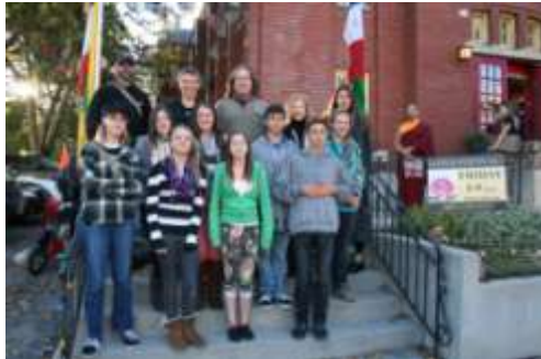
Youth at Tibetan Buddhist Temple for Lotus Fest (10/5)