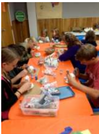
Monday Menus - Making Sugar Skulls (10/14)